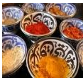
Ras El Hanout translates to "top of the shop" and refers to the quality of spices in its irresistible blend

cheeses, meats and vegetables. A current favorite recipe is quick and easy. Simply coat pita bread (try sprouted wheat Ezekial) with